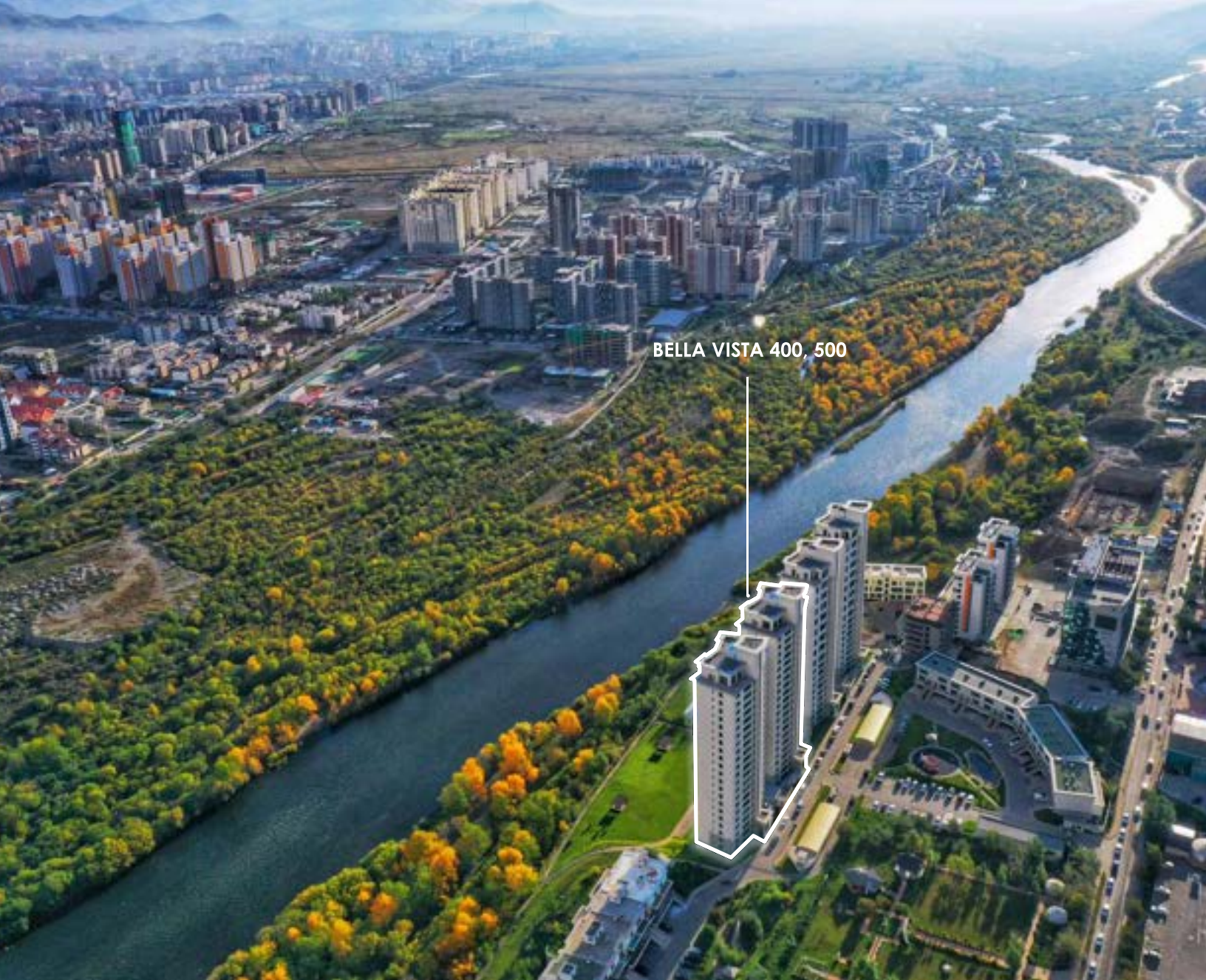
BELLA VISTA 400, 500